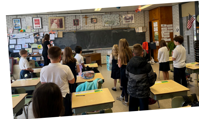
ABOVE: Students begin their days with prayer and the Pledge of Allegiance.