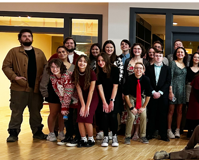
Alumni joined PPA high school students for our annual Homecoming party.