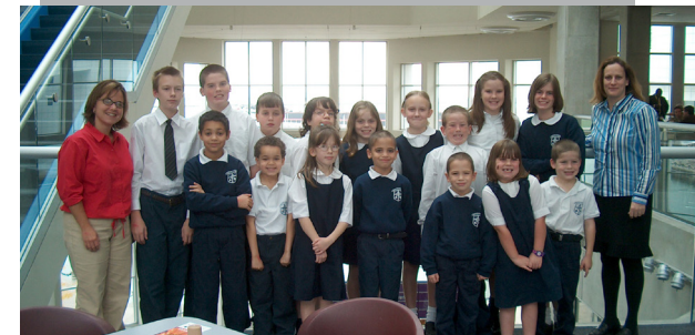
The first official photo of the school from October 2003.