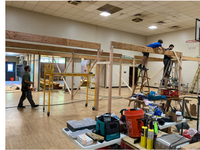
Two new classrooms were built above the gym to accommodate our growing student body.