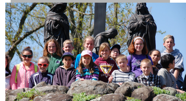
One of the many PPA trips to Gettysburg, PA.

"REJOICE IN THE LORD ALWAYS; AGAIN I WILL SAY, REJOICE!" (PHIL 4:4)